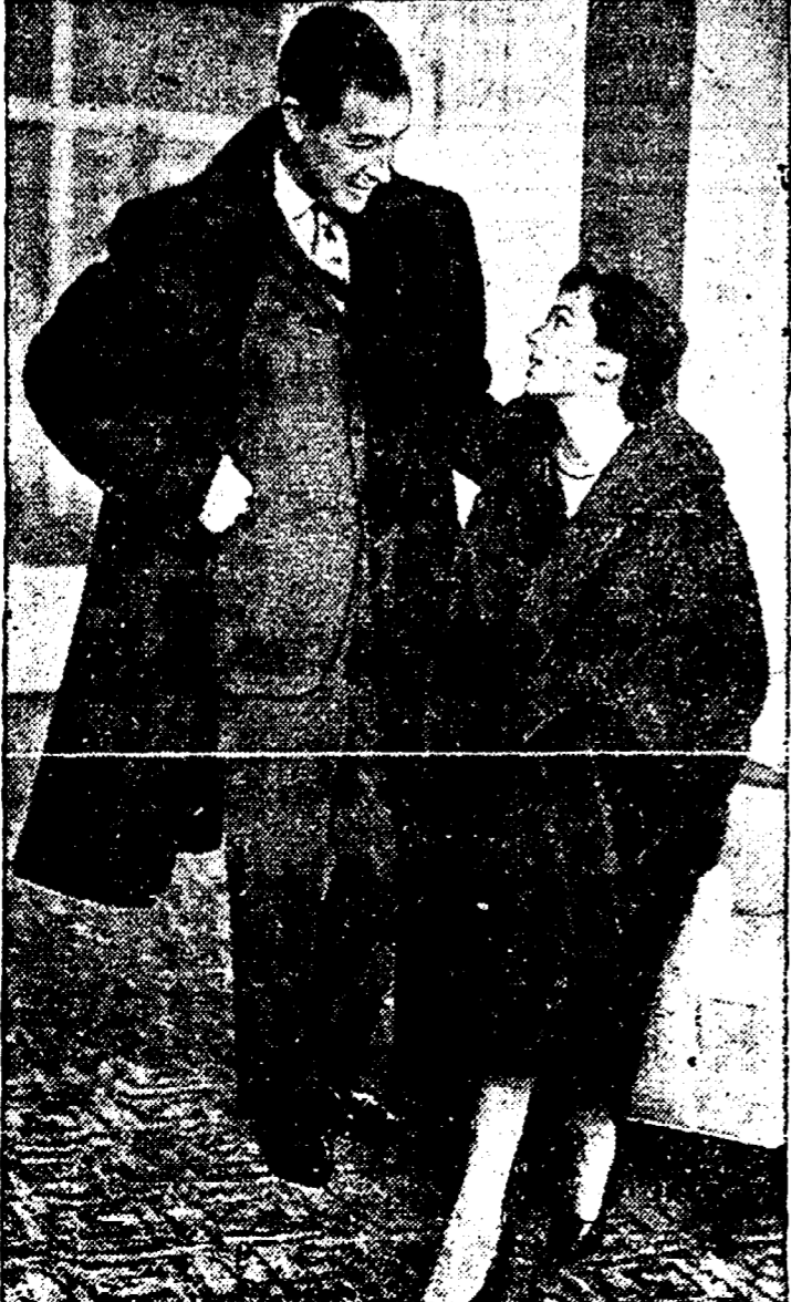
STYLE PLUS —Prize mink skins and precious vicuna are combined for one of next season's most exclusive "his and hers" costumes. Displayed at a fashion show in New York's Sheraton East Hotel, the man's coat is lined and collared in mink, with the vicuna on the outside. The lady's coat is just the reverse.