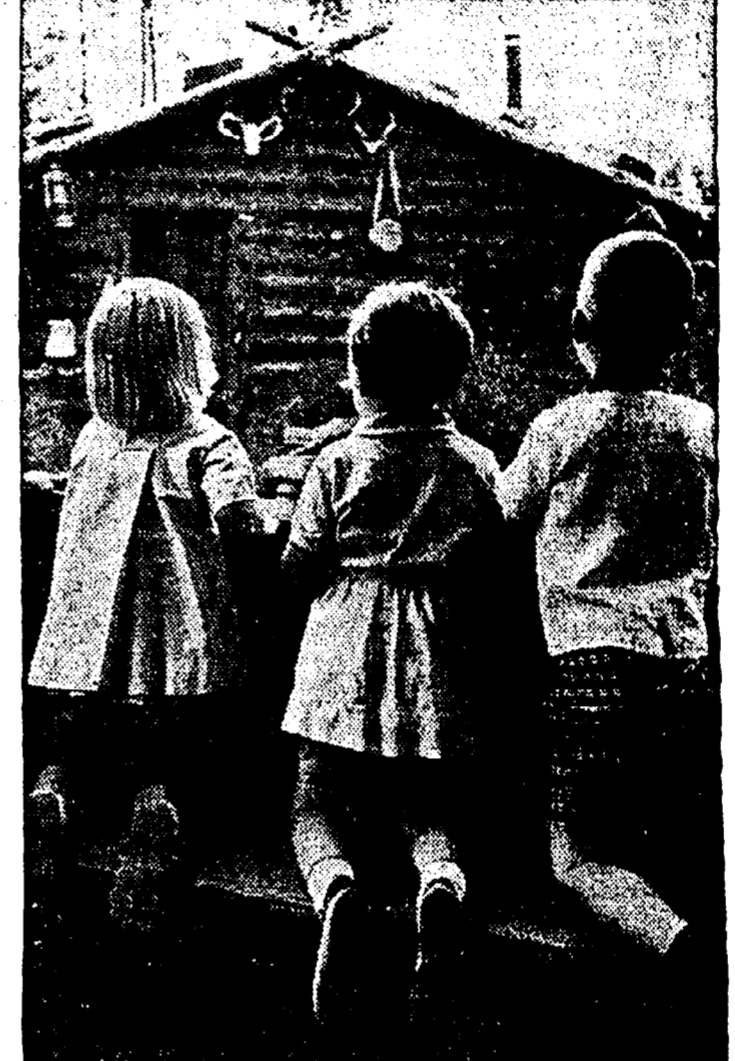
KNEE ACTION —The answer to any kid's prayer has these three youngsters on their knees. They're fascinated as they ride a "Trapper's Boat" past a frontier cabin on a tour of Freedomland, the new amusement park in the Bronx, N. Y. American history is the theme of the $65 million attraction.