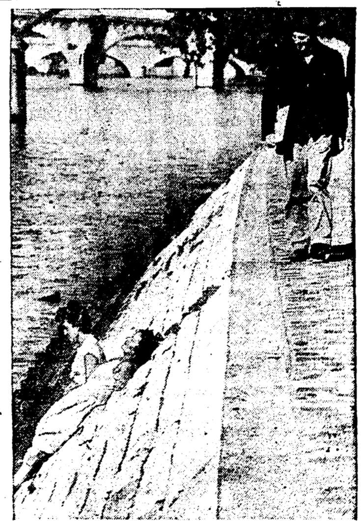
BANK FIGURES —Drawing plenty of interest, this Seine River bank is giving extra dividends to male pedestrians. Parisians like to deposit themselves here to soak up the sun and the warm glances of admiring gentlemen.