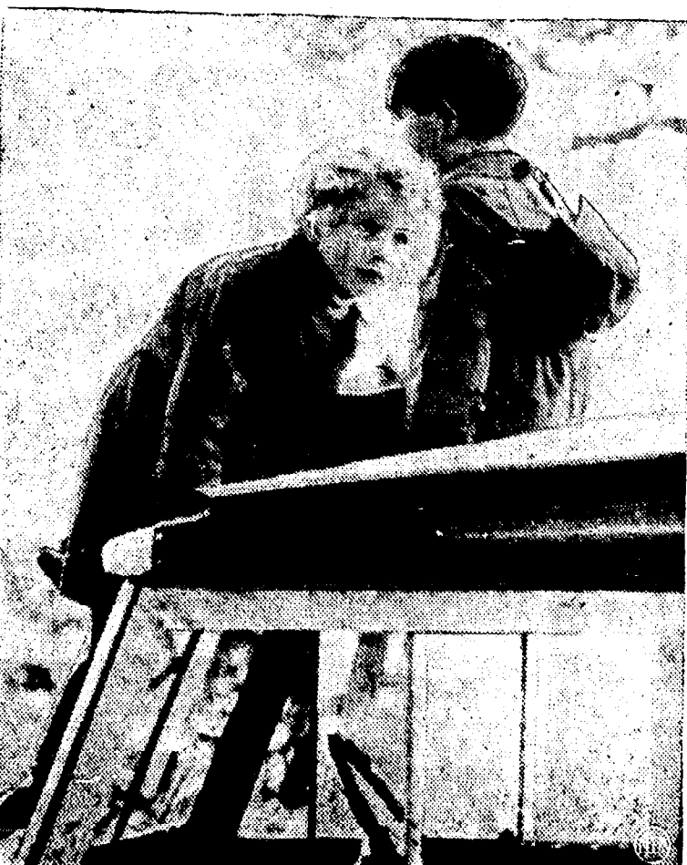
Princess Anne follows the lead of her brother, Prince Charles, and scrambles to the top of an English station wagon, the better to see the European Horse Trials at Windsor Great Park, Windsor, England.